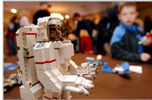
An astronaut made from LEGO blocks is shown on display on Saturday, Feb. 26, during the LEGO-palooza event held at Morehead Planetarium's Banquet Hall.