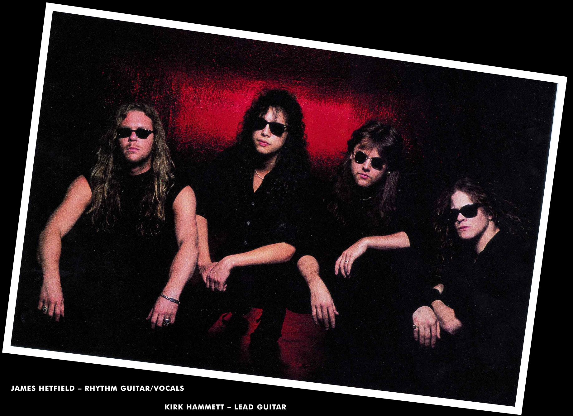
JAMES HETFIELD – RHYTHM GUITAR/VOCALS