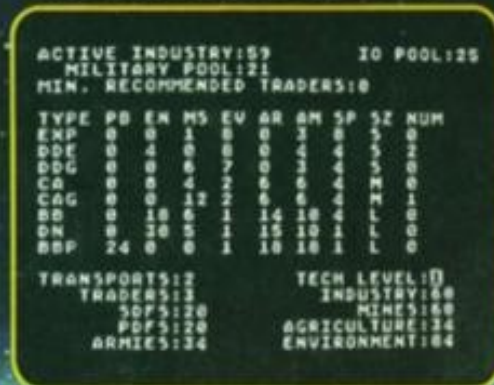
Production phase display.

Where once Rome conquered a world, now you can conquer a universe.