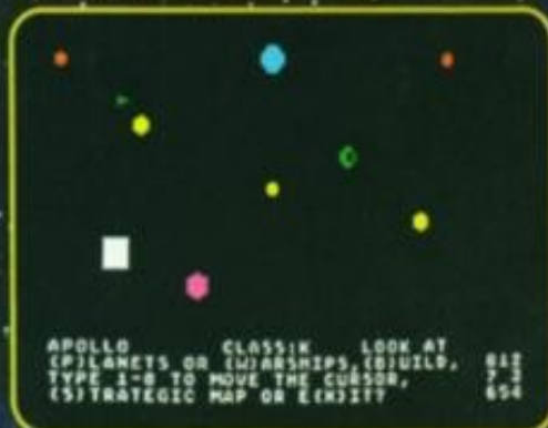
Tactical screen display for a closer look.