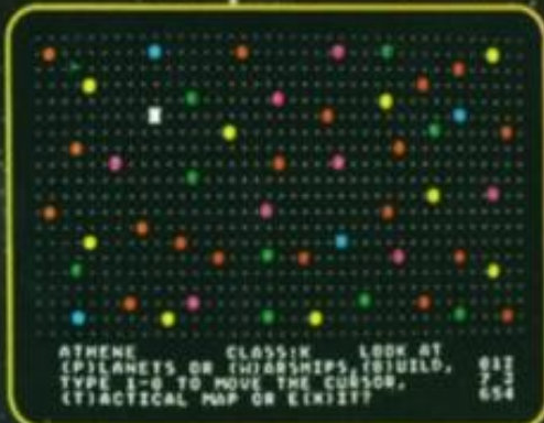
Strategic map shows the entire star system of the game.