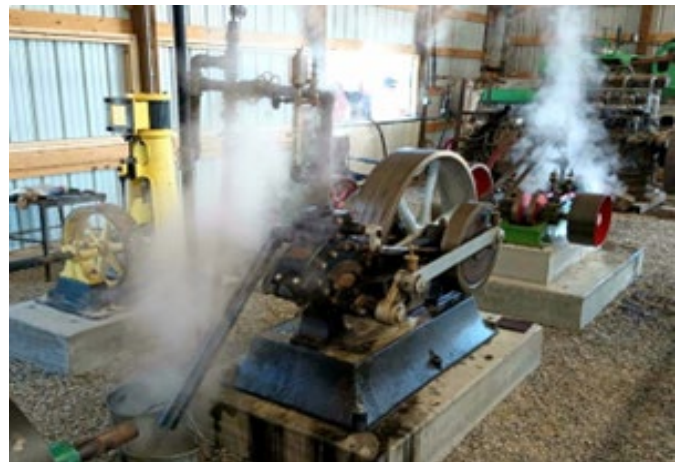
This photo shows part of the steam engine room where there is a permanent display of various size steam engines donated by the family of a former Branch 29 member.