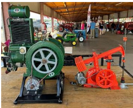
Branch #220 Waco Antique Farm Machinery Club, Lorena, TX

There was a very good public turn-out, many returning vendors and some new ones as well, some new sources of delicious food, and great pieces of antique machinery. Yours truly was featured in the local newspaper, and even snagged a ribbon or two.