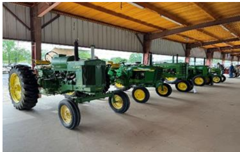
Branch #124 Lonestar Antique Tractor & Engine Assoc, Whitehouse, TX

We are finally drying out here in North Texas from the torrential downpours that have plagued us all spring and into June. First item of business, I would like to thank several EDGE&TA Branches that worked together to put on the Canton, TX show earlier this year in April. This group partnered up with several other local clubs to make this event the biggest of its kind in North Texas.