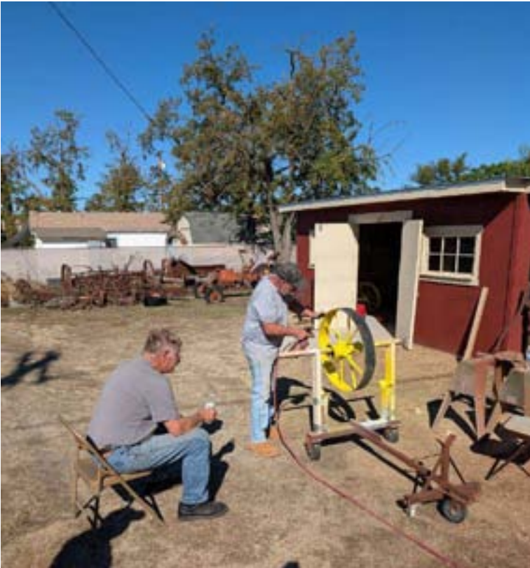
Painting the wheels