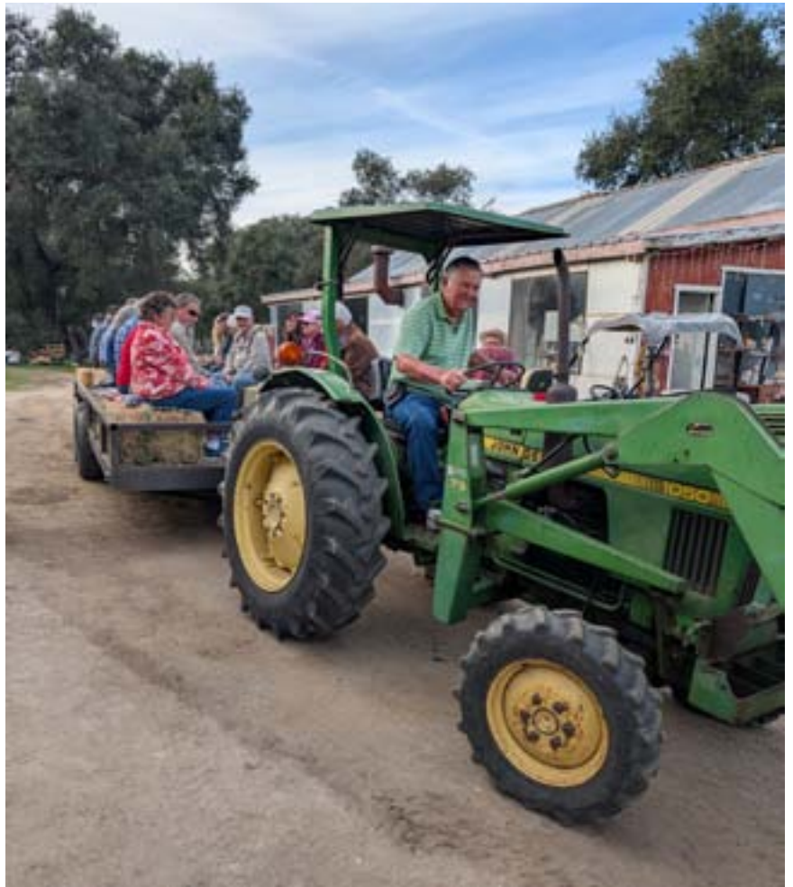
Getting ready for the Hay ride