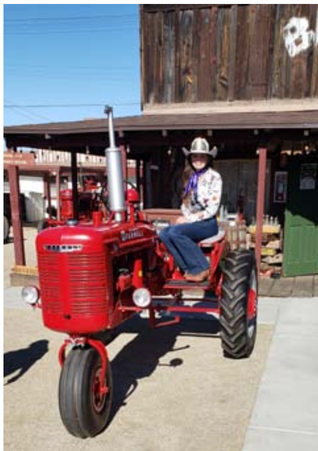
Even Rodeo Queens love tractors