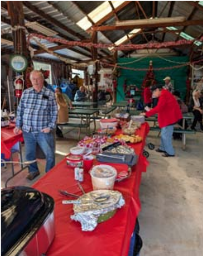
Gathering in the Barn