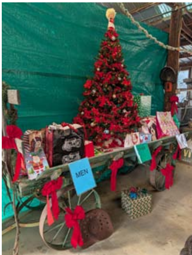
Ready for the gift exchange