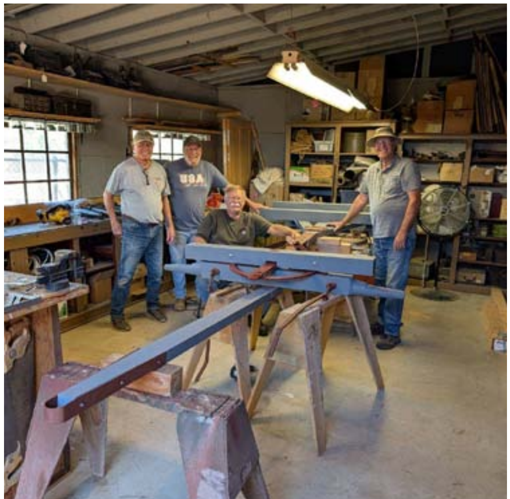
Some of the volunteers