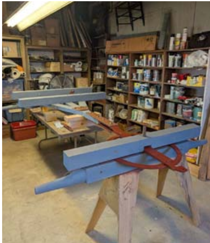
Chassis ready for finish