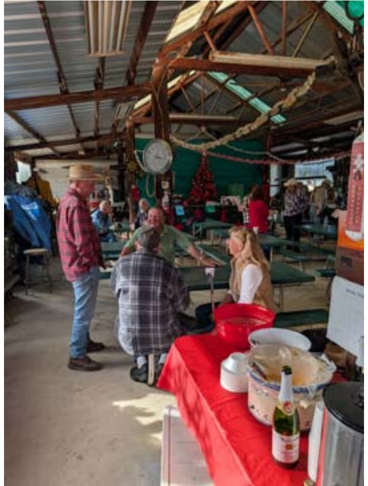
Lots of good food