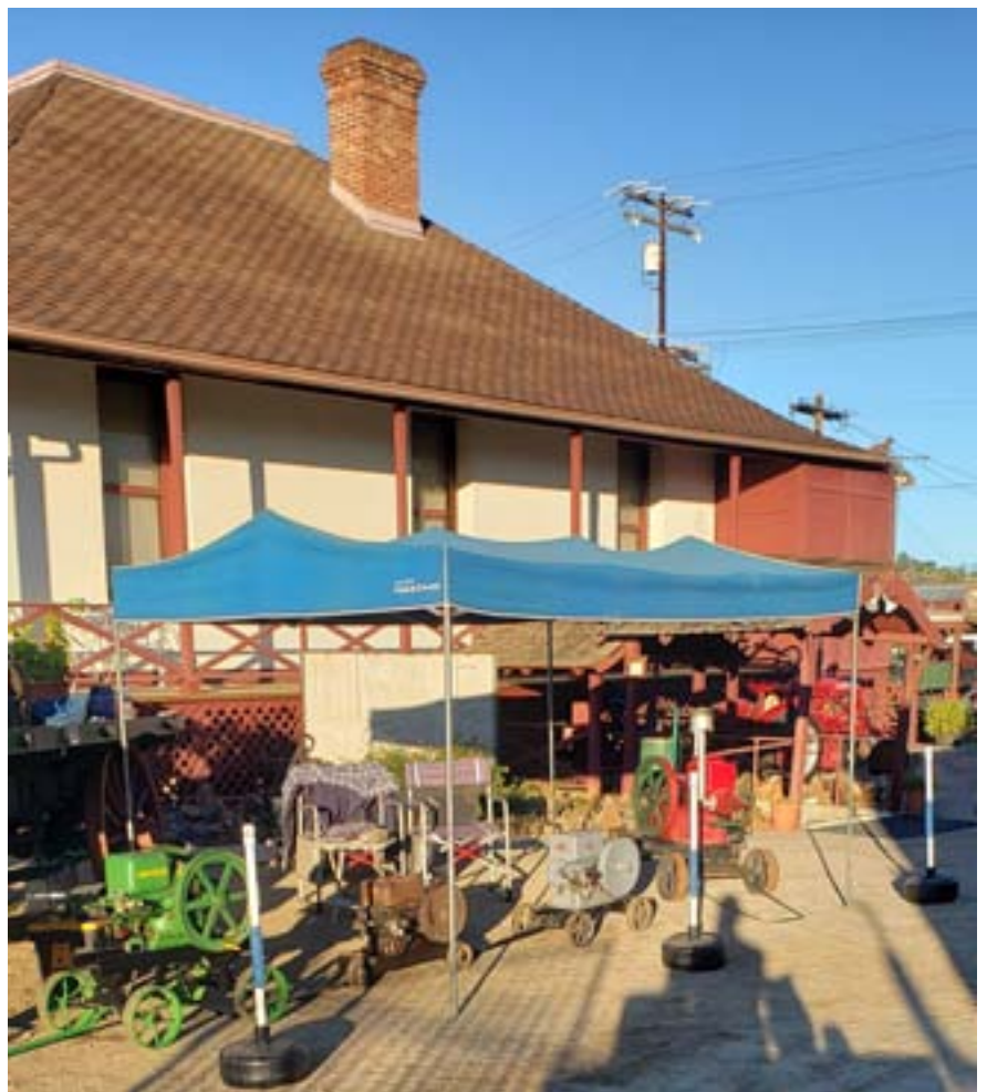
The engines on display