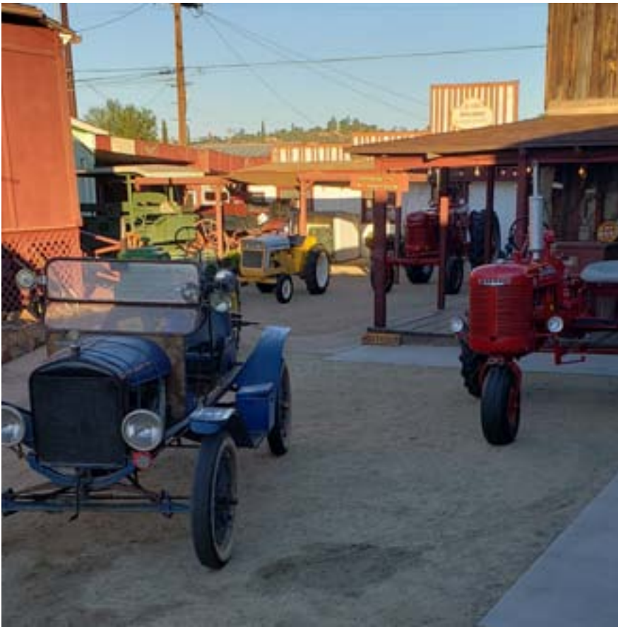
The museum courtyard with wagons, tractors and cars on display