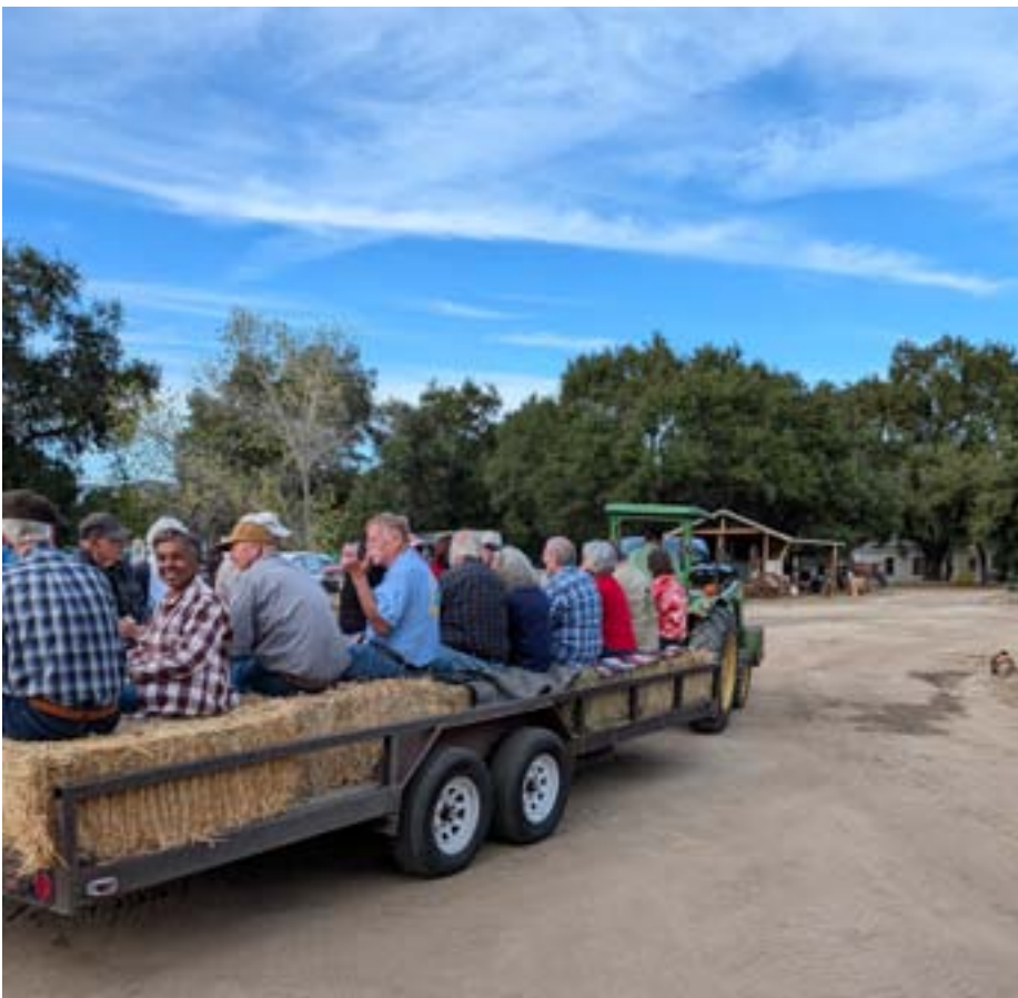
And they're off!