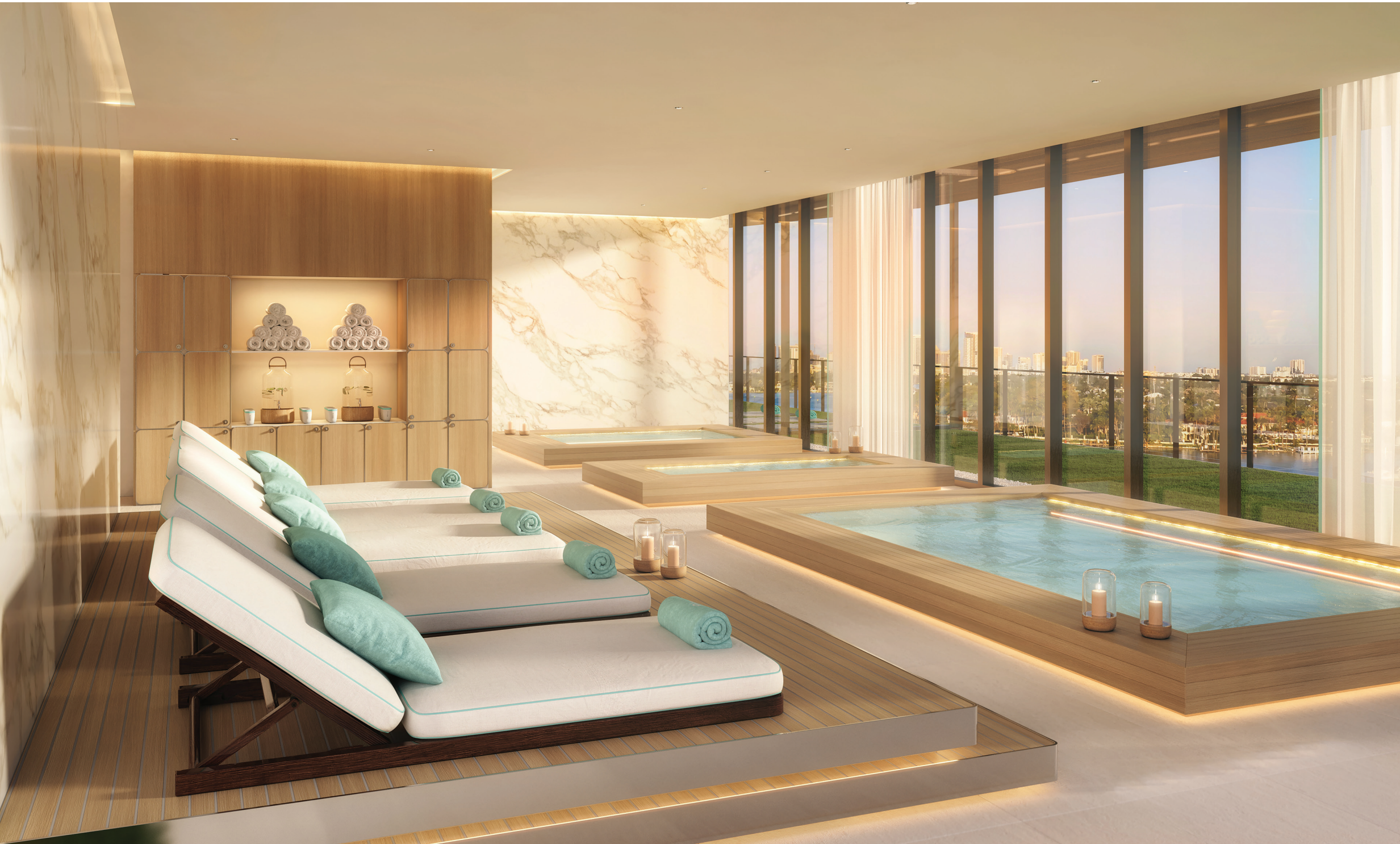
Transformative sanctuary with heated spa, steam and sauna rooms, and bespoke treatments

With over 20,000 SF of dedicated amenity space, each amenity at Riva Residence is its own unique point of arrival, thoughtfully placed and designed to create a sense of movement and balance that touches every sense. As with the streamlined, curved interiors of a yacht gliding through water, every space unfolds in a crescendo of experiences—a curated art gallery, a serene garden, a sunrise bar and lounge, a sunlit executive boardroom—all leading up to a tranquil sky lounge and sun deck.