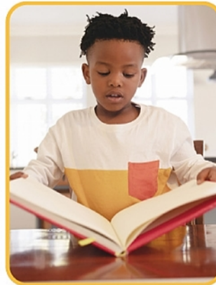
Open your book.