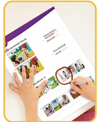
Circle the picture.