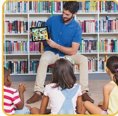
Look at the picture.