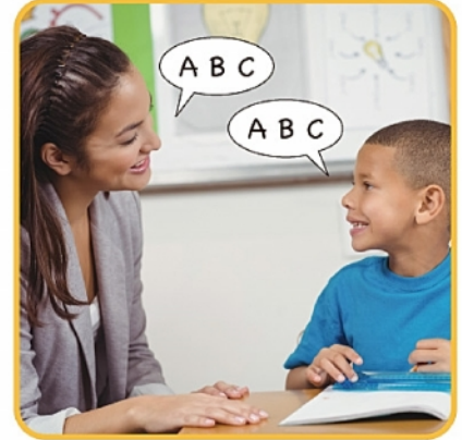
Repeat after me.