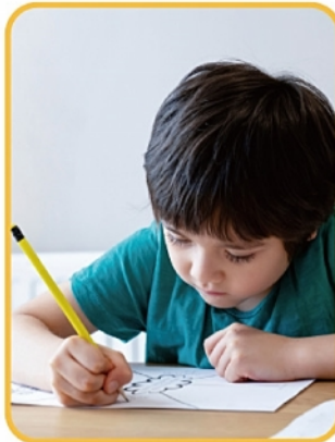
Write the words.