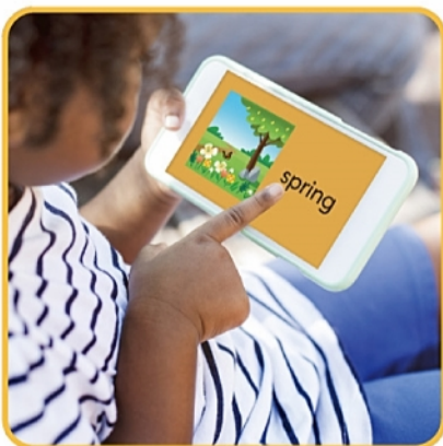
Point to the word.