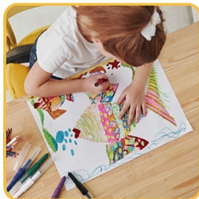
Color the picture.