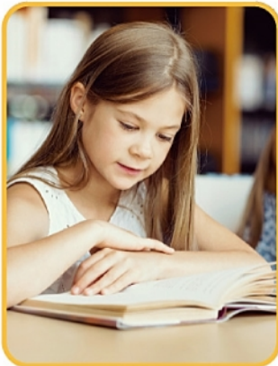
Read the story.