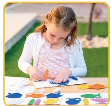
Stick the stickers.