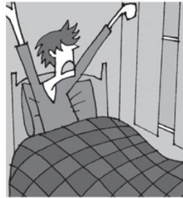
0 He has just _____ woken up.