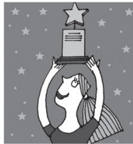
4 She _____