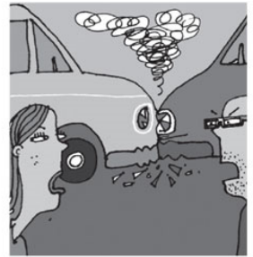
1 They _____