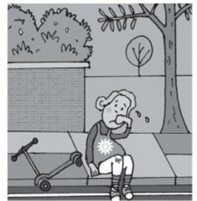
3 She _____