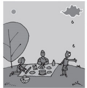
5 It _____