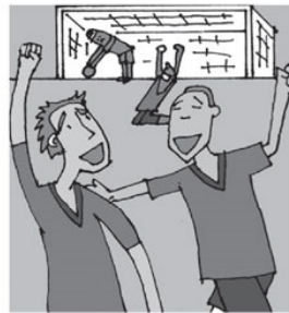
2 They _____