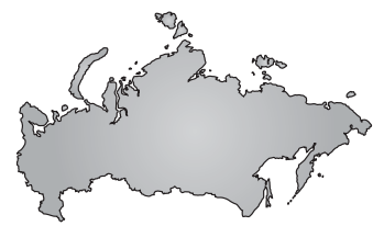
12 R _____