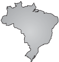
5 B _____