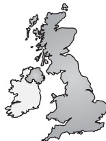
10 the _____