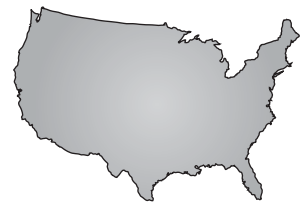
4 the _____