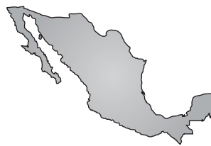
11 M _____