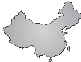
7 C _____