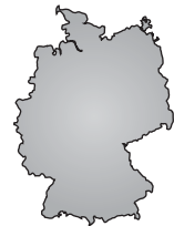
8 G _____