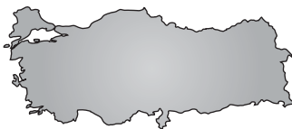
9 T _____