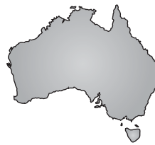
3 A _____