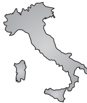
2 I _____