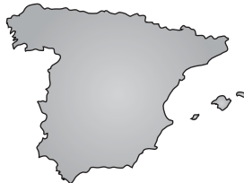
6 S _____