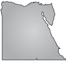
1 E g y p t