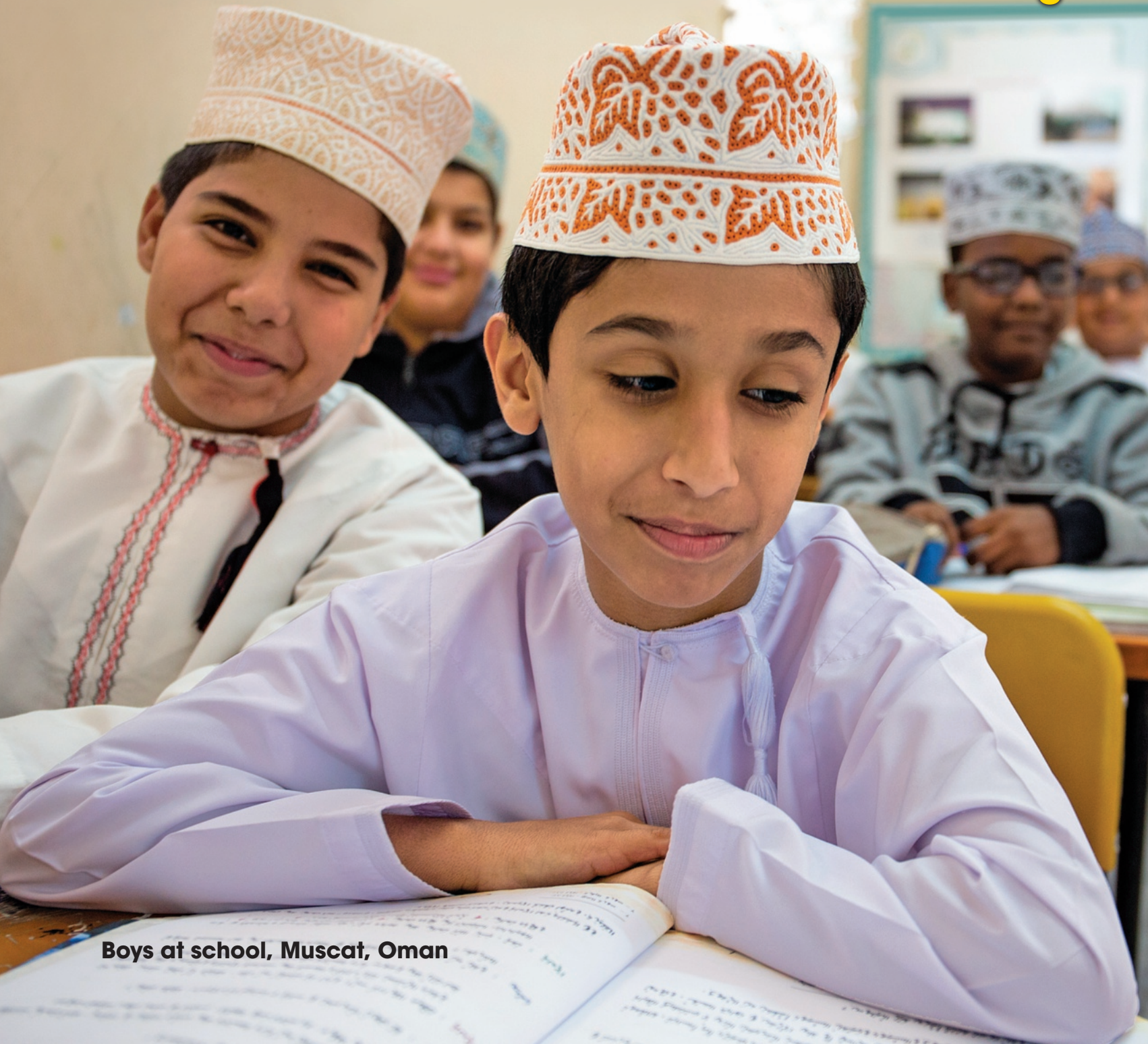
Boys at school, Muscat, Oman

Look at the photo. Answer the questions.