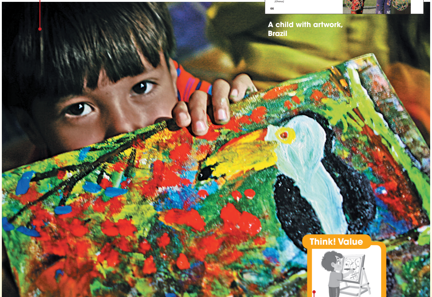
A child with artwork, Brazil