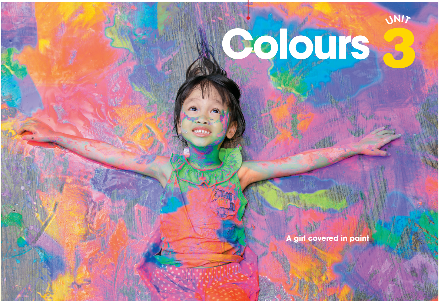
A girl covered in paint

A high-impact photo engages students' interest and introduces them to people, animals and places around the world. The About the Photo section in the Teacher's Book gives additional background information about the photo.