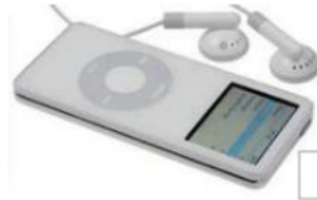
an MP3 player