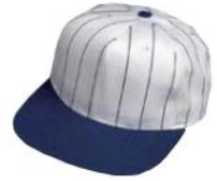
a baseball cap