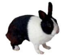
a pet rabbit