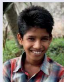
Sunil Mittal, India

Hello. I'm Anna, and I'm in the 8th Grade at school. I'm 13. I don't have a lot of friends but I've got two very close ones: Anastasia and Oksana. My family has a house in the country and I often spend time there with Anastasia and Oksana. I haven't got any brothers or sisters, so it's good to have friends to play with. I've got a computer and we love playing games on it together.