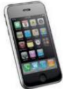
a mobile phone