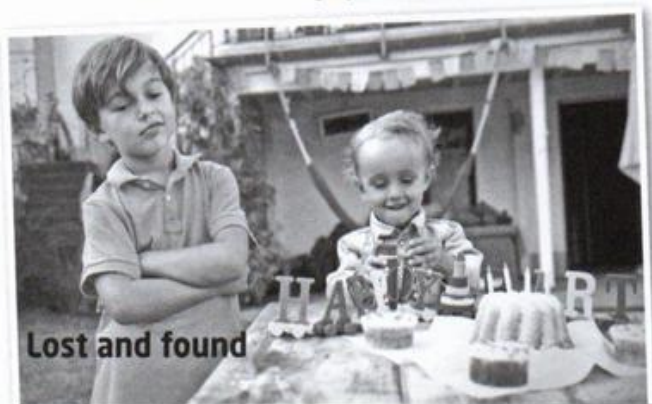
8 Lost and found