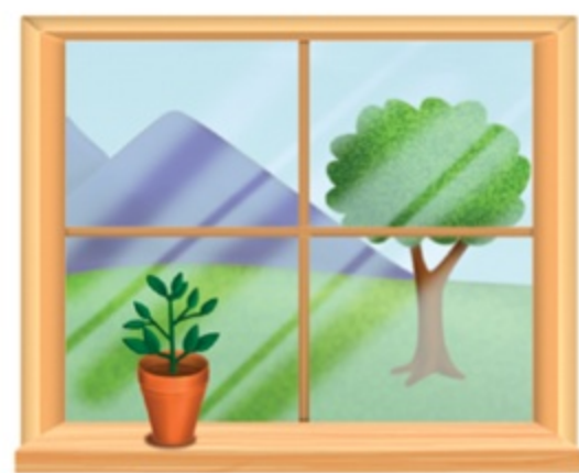
2. a window