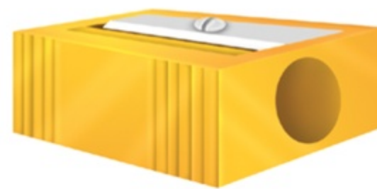
3. a pencil sharpener