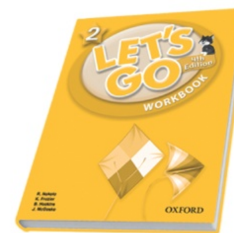
4. a workbook