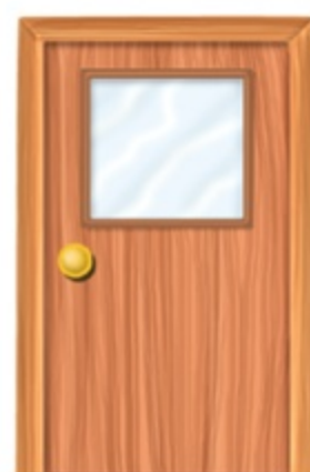
7. a door