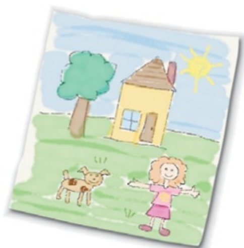
1. a picture