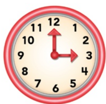
6. a clock