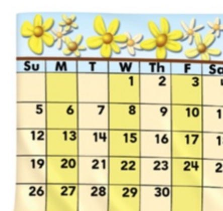
8. a calendar