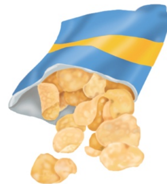
5. potato chips