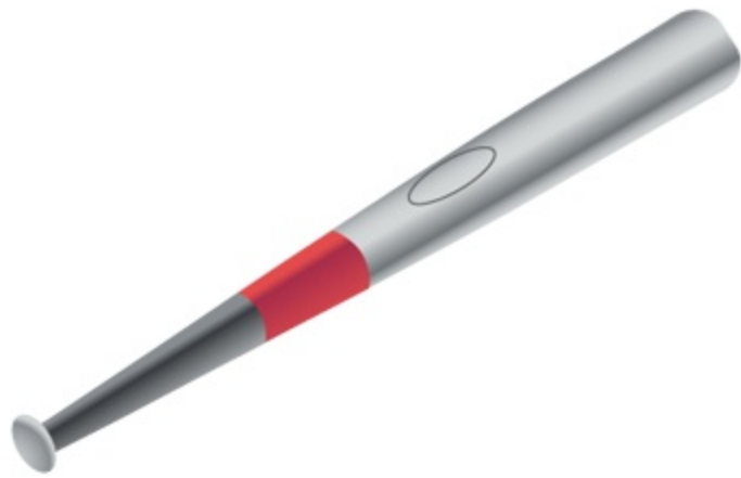
2. a bat