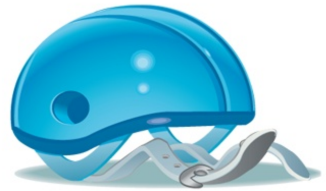
4. a helmet