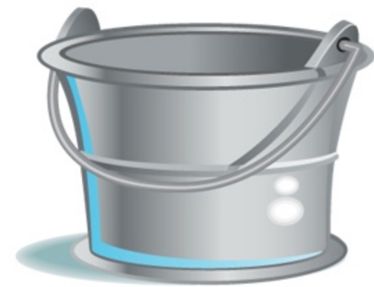
8. a bucket