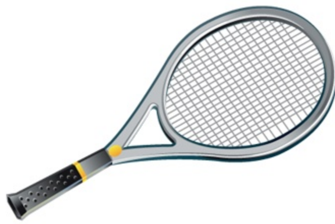
6. a tennis racket