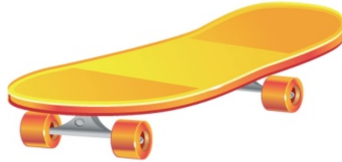
3. a skateboard