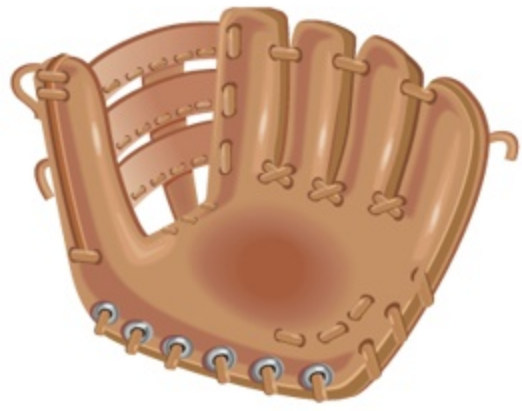
1. a mitt