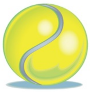
5. a tennis ball