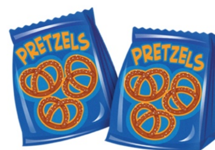
4. bags of pretzels