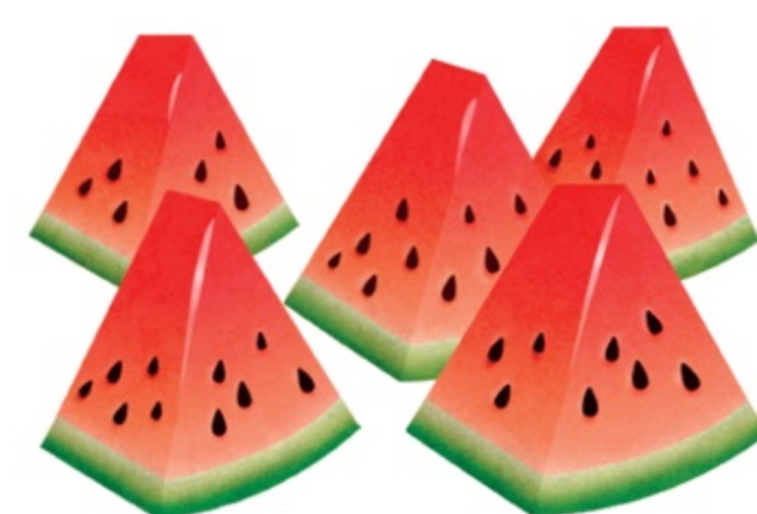
8. pieces of watermelon