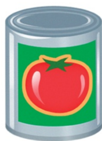
1. a can of tomatoes