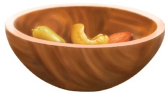
2. a few nuts