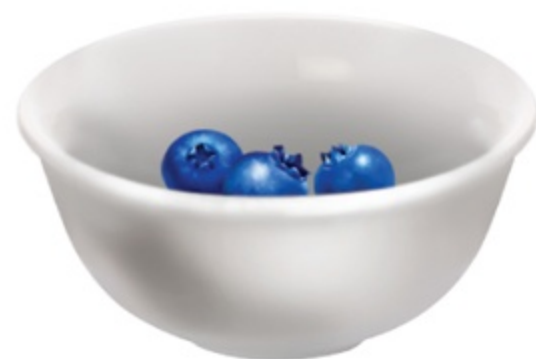
6. a few blueberries