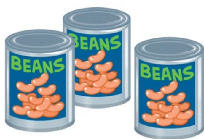
2. cans of beans