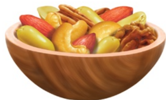
1. a lot of nuts