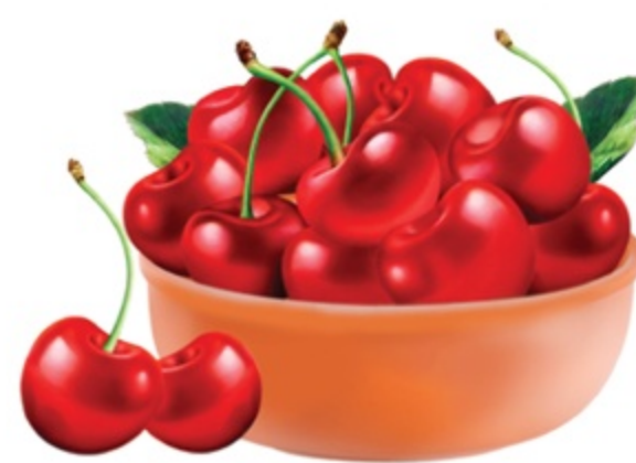
7. a lot of cherries