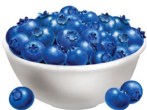
5. a lot of blueberries