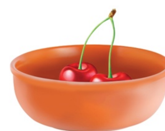
8. a few cherries