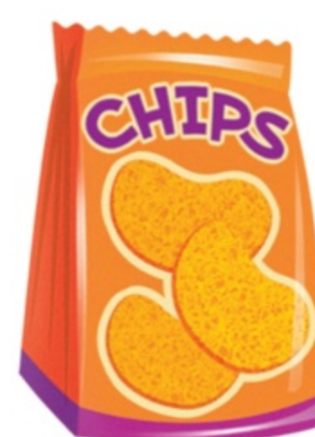
3. a bag of potato chips