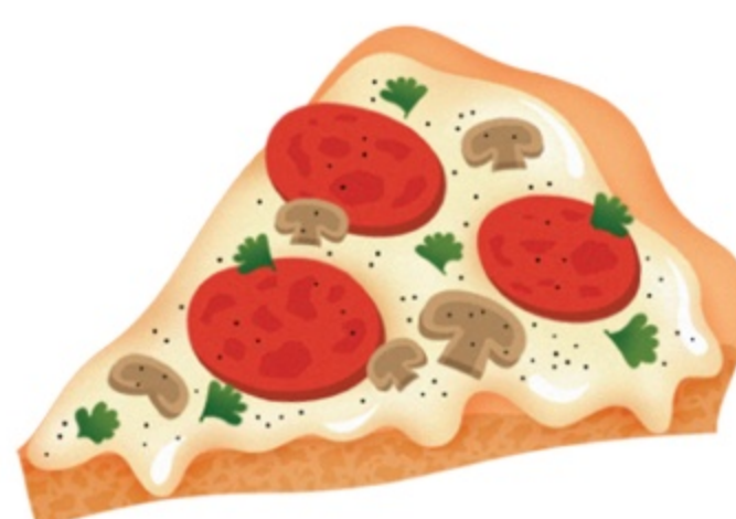
7. a piece of pizza