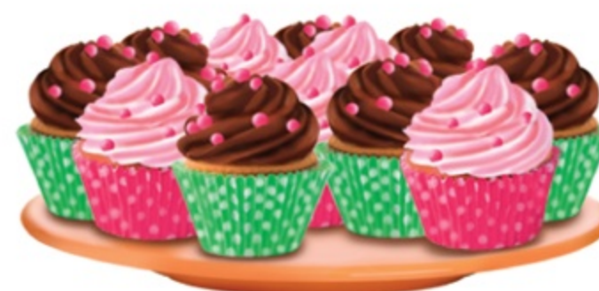
3. a lot of cupcakes