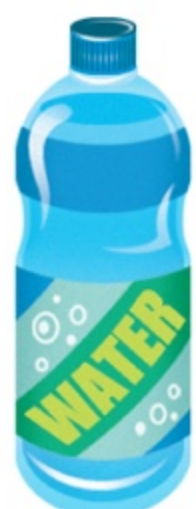
5. a bottle of water