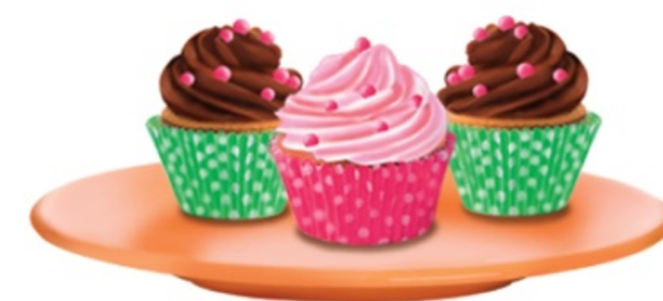
4. a few cupcakes