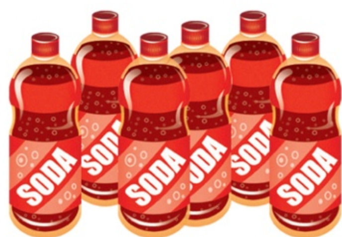
6. bottles of soda