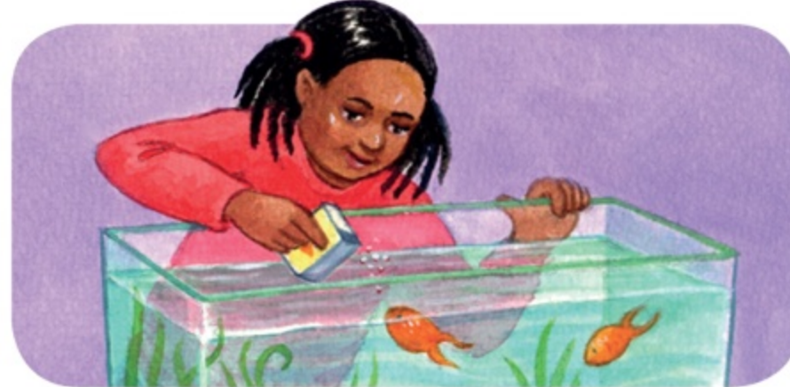
2. feeding the fish