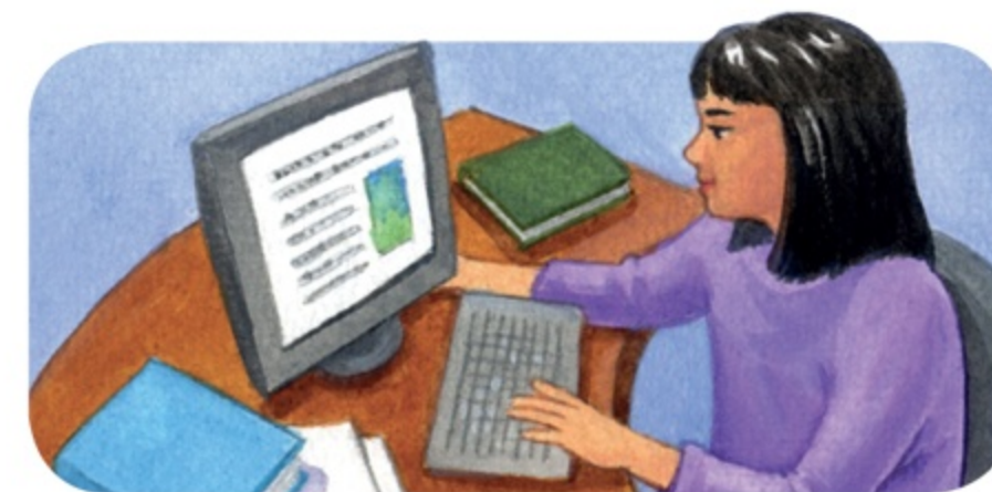
6. writing an essay