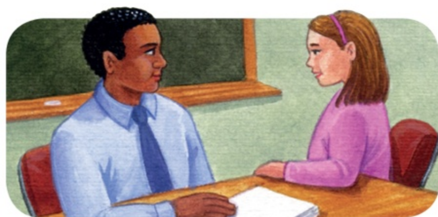
4. talking to the teacher