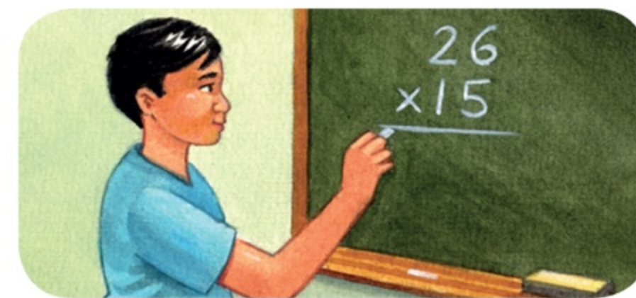
3. writing on the board