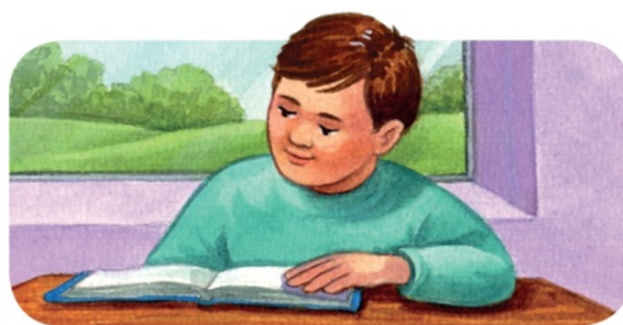
5. reading a textbook