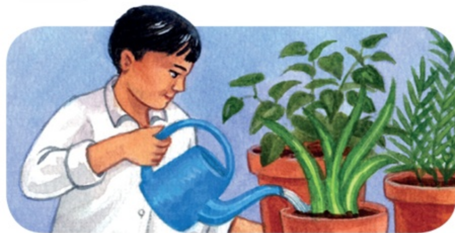
1. watering the plants