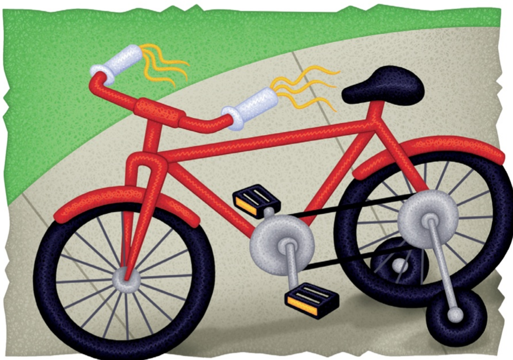
4. a bicycle