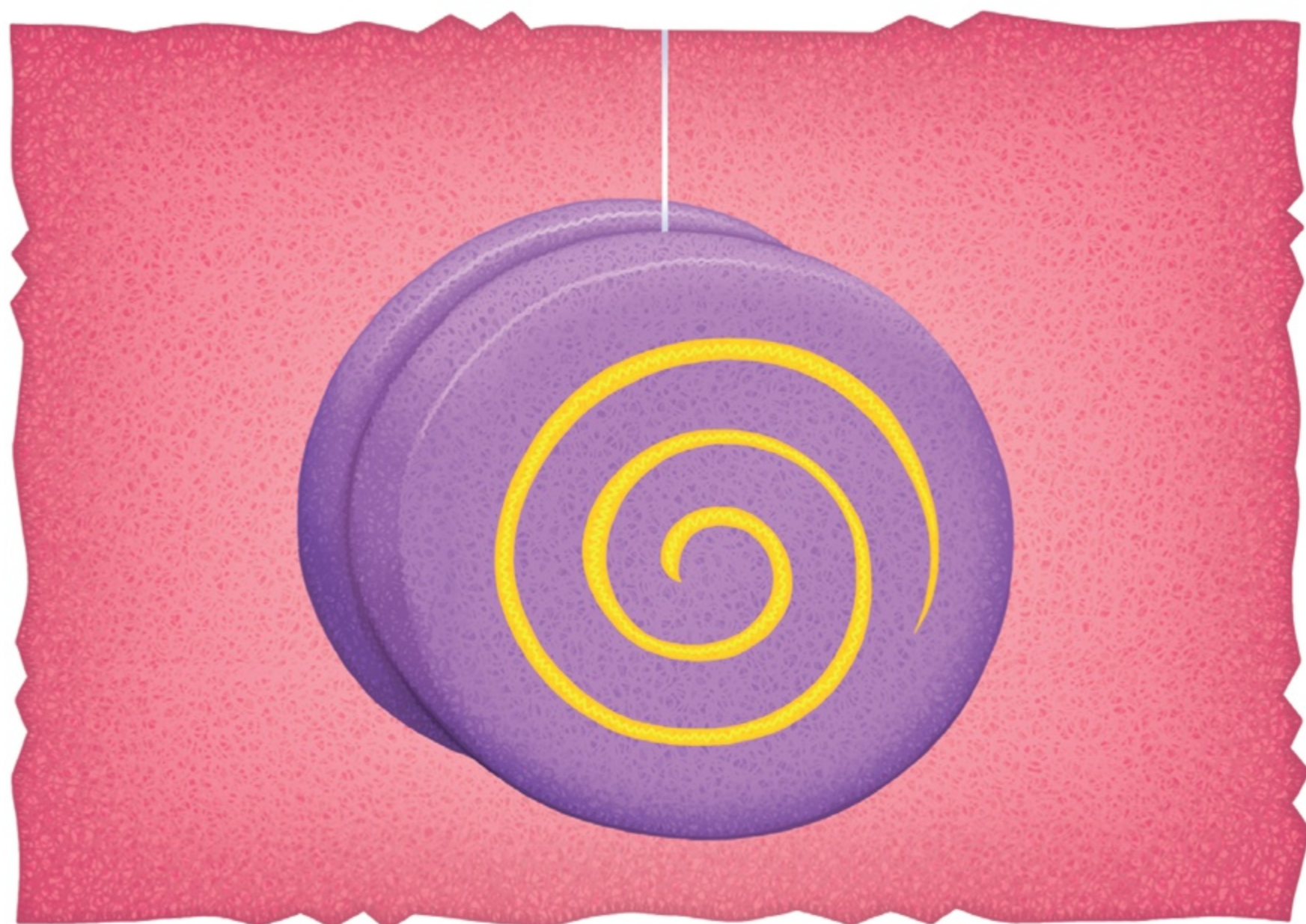
3. a yo-yo