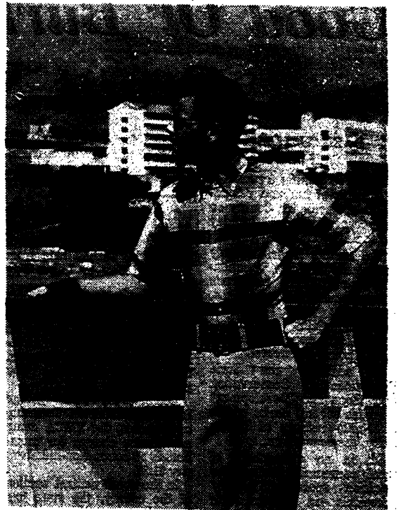
WHAT A WAY TO GO — For carefree ship-board life or vacation-time sightseeing is this multiplaid shirt. It has an added attraction: It's travel-ready and packable.

For a Summer dessert that's cool looking and easy enough even for the children to make, try enhancing ice cream by topping with various types of candy such as crushed peanut brittle, crushed pastel mints, patties or nuts.