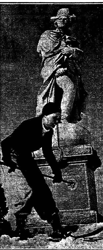
The status of George Washington in Cadwalader Park has a special significance today for it's the first President's birthday anniversary.