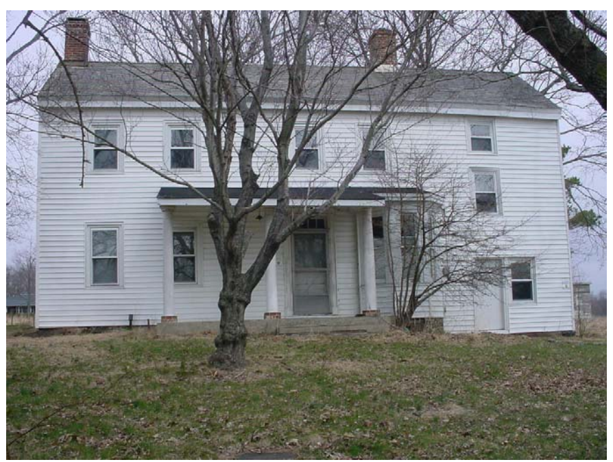
Building "A"-2-Story Farm House-Front (1584 s.f., 3 bedrooms, 1 bath)