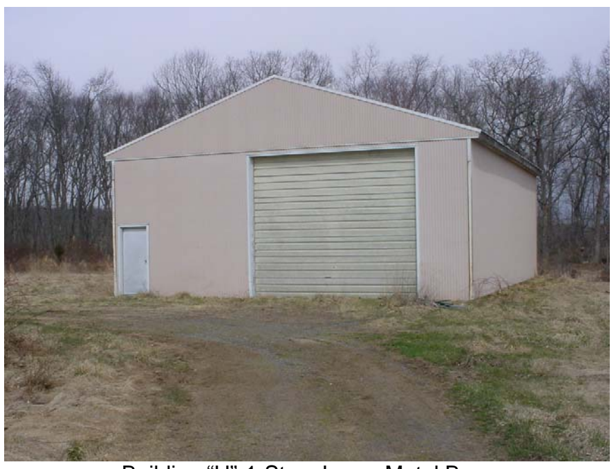
Building "H"-1-Story Large Metal Barn (1620 s.f.)