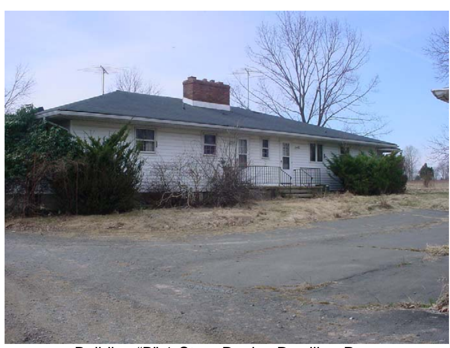
Building "B"-1-Story-Duplex Dwelling-Rear