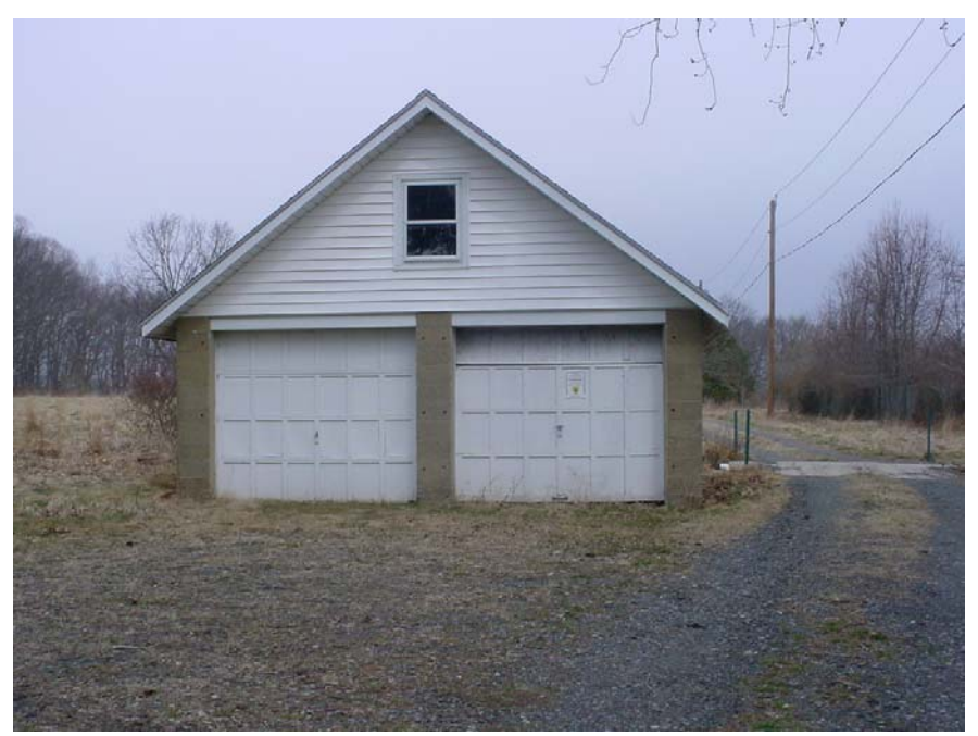
Building "C"-1-Story-2-Car Block Garage (400 s.f.)