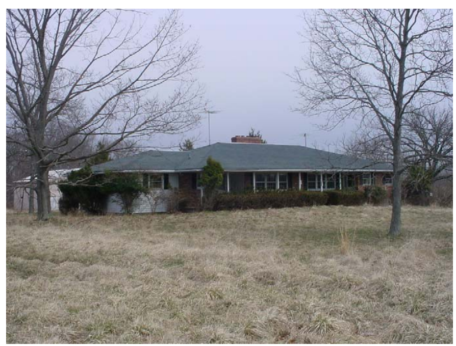
Building "B"-1-Story-Duplex Dwelling-Front (2472 s.f. total) Unit #1 =1328 s.f., 3 bedrooms, 1 bath, Unit #2=1144 s.f., 2 bedrooms, 1 bath