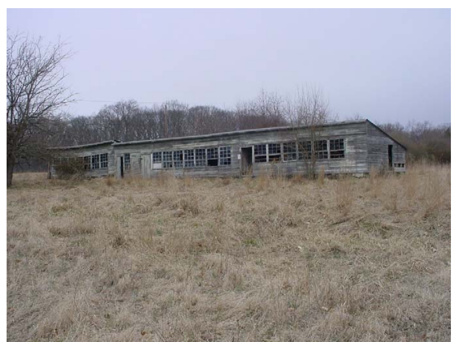
Building "E"-1-Story-Chicken Coop (2000 s.f.)