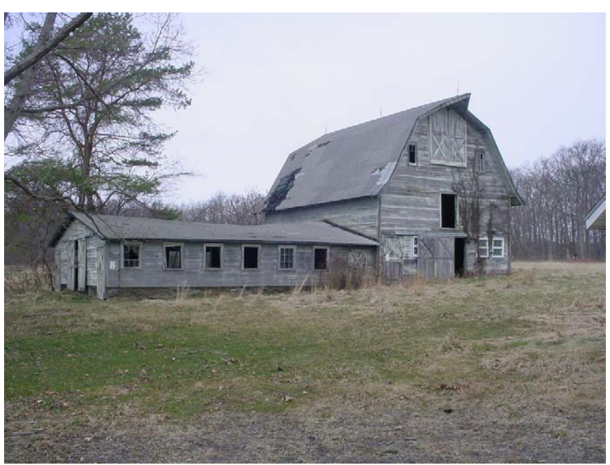
Building "D"-2-Story-Dairy Barn-East Side (s.f. unknown)