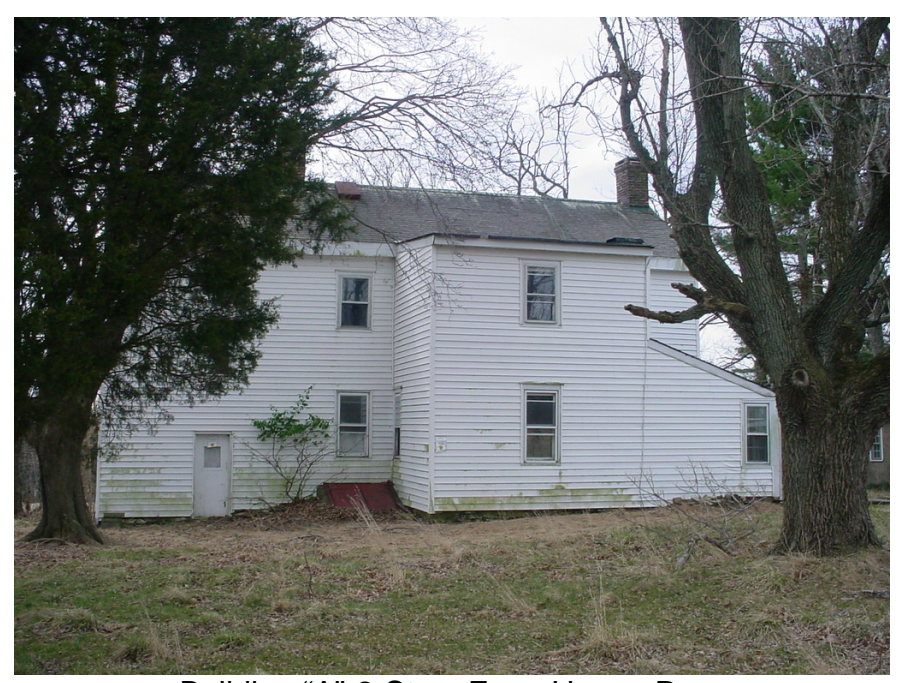
Building "A"-2-Story Farm House-Rear