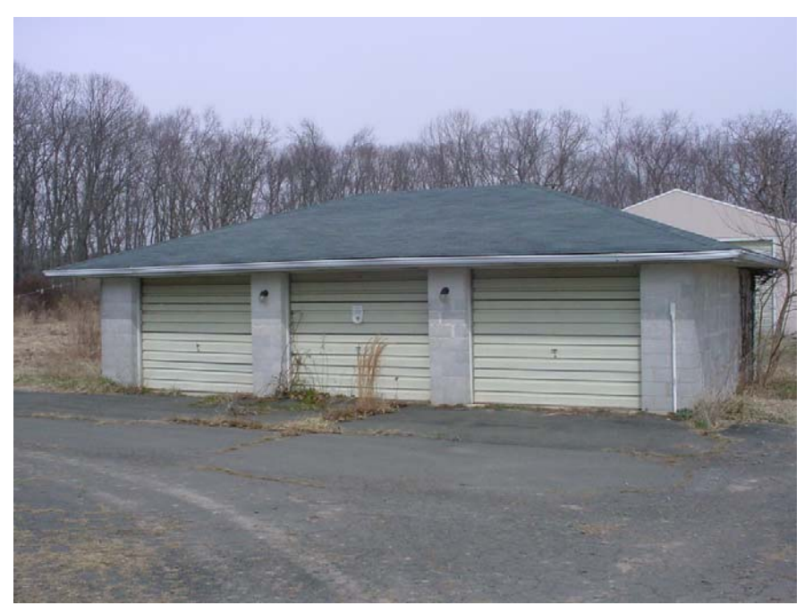
Building "G"-1-Story-3-Bay Block Garage (864 s.f.)