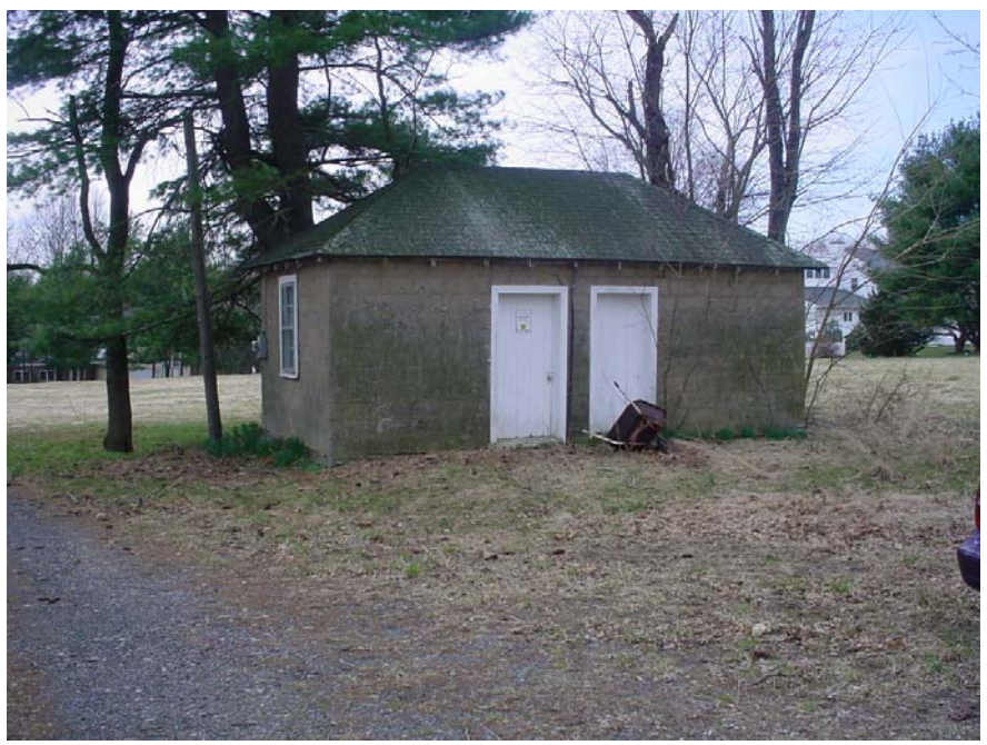
Building "F"-1-Story-Block Shed/Pumphouse (s.f. unknown)