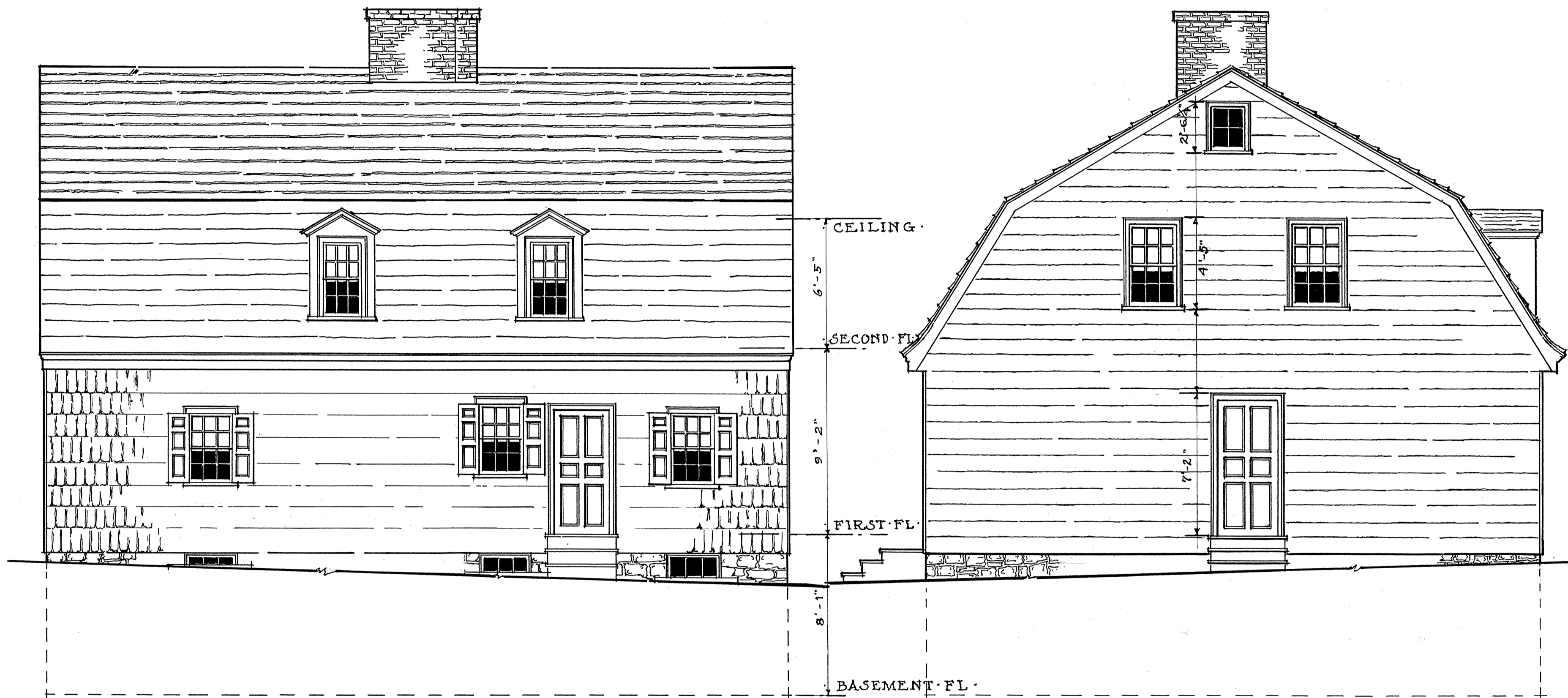
· NORTH · ELEVATION ·