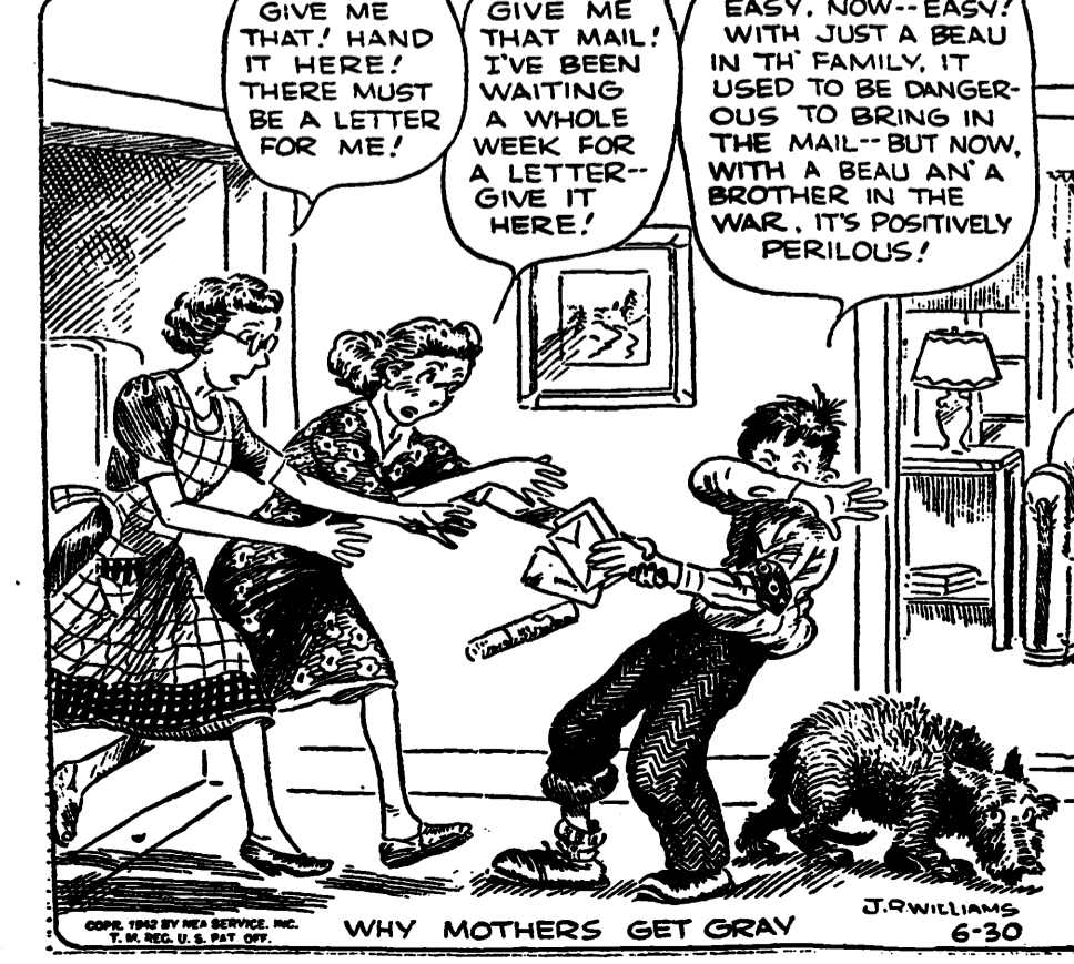
WHY MOTHERS GET GRAY - 6-30