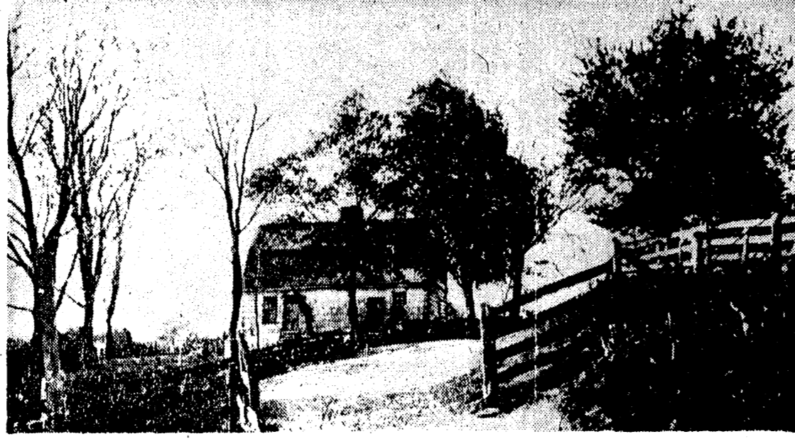
A great many changes have taken place since this picture of the old McKonkey Ferry House at Washington Crossing, N. J. was taken. This shows the building when it was still part of a farm and some 25 years before the Washington Crossing State Park was established and the house restored as a historic site. It was at this house that General Washington rested after crossing the Delaware River on Christmas night, 1776. After a two-hour respite, he and his bedraggled army moved on through the snow for the march on Trenton where they surprised the Hessians under Colonel Rall and won the Battle of Trenton on the morning of December 26.