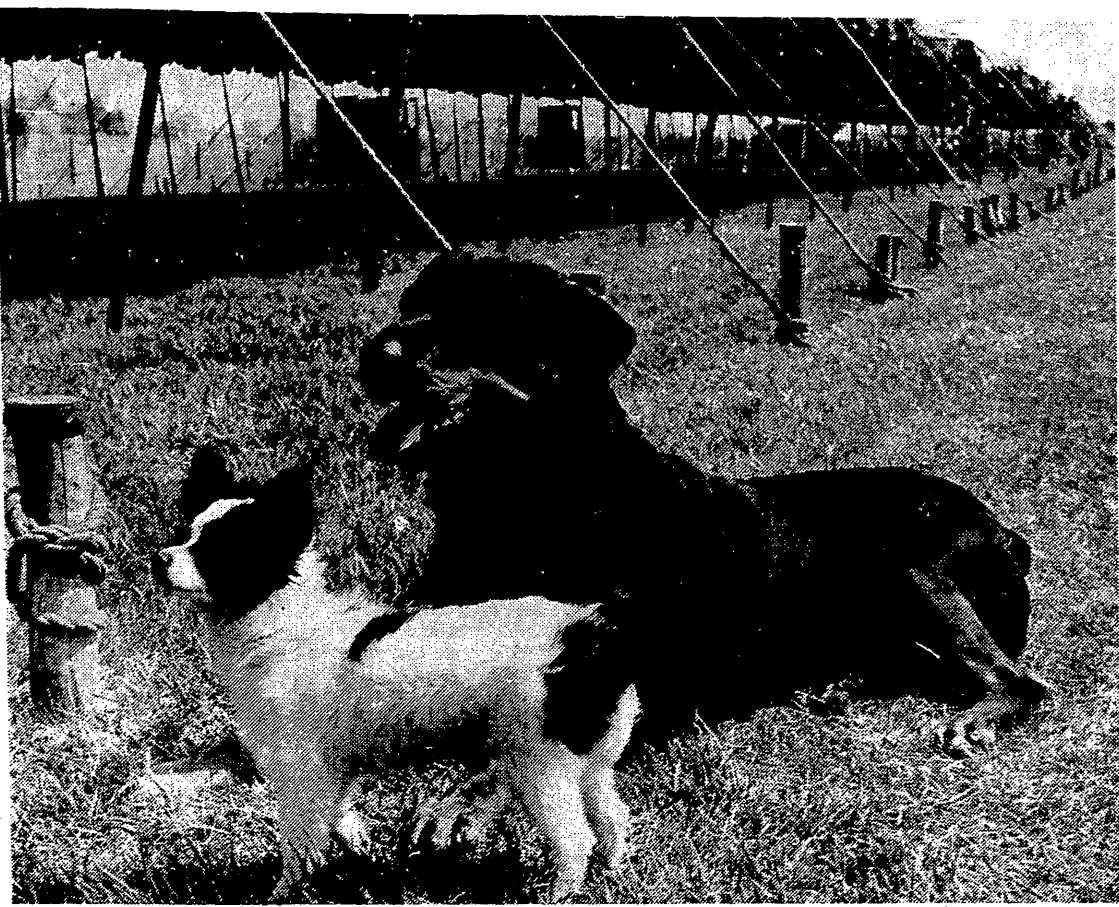
LOOKING THINGS OVER— Early arrivals yesterday for the Trenton Kennel Club Dog Show today get a first hand glimpse of how things will be at the Washington Crossing State Park show grounds. The black dog is entered in the event which starts at 8 a.m. He