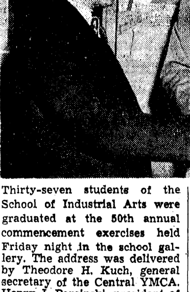
Thirty-seven students of the School of Industrial Arts were graduated at the 50th annual commencement exercises held Friday night in the school gallery.