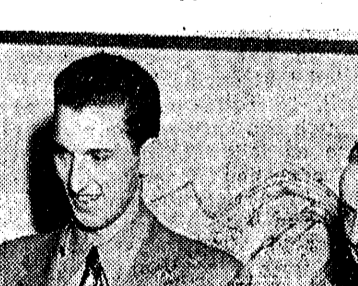
Thirty-seven students of the School of Industrial Arts were graduated at the 50th annual commencement exercises held Friday night in the school gallery.