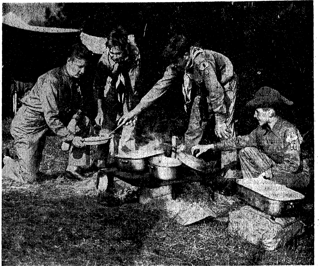
The two pictures shown were taken at the Camporal staged this weekend by Boy Scouts of George Washington Council at Washington Crossing State Park.