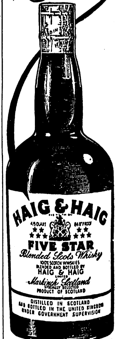
BLENDED SCOTCH WHISKY • 86.8 PROOF RENFIELD IMPORTERS, LTD., NEW YORK