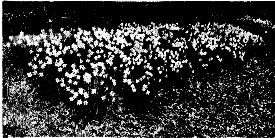
Patches of Spring flowers brighten Washington Crossing State Park